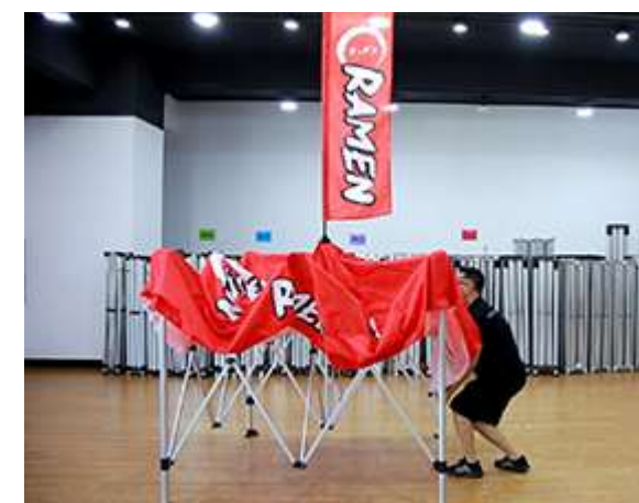
8 Adjust the tent to proper height