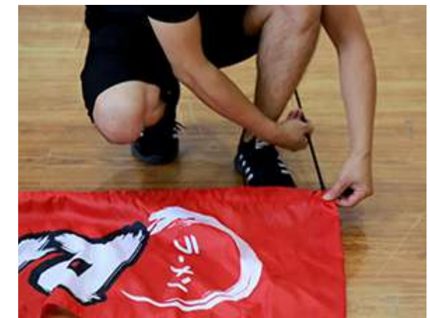
6 Insert the vertical pole into the side pole pocket, and the shorter pole the top pole pocket