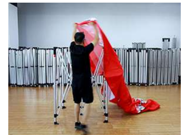
3 Unfold the tent frame and cover the tent top on it