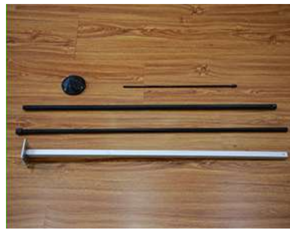
1 Lay all parts on floor

Tent - 10'x10' (40mm Hex) Peak Flag - 18"x59"