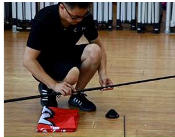
4 Connect the 2 long tubes to get a vertical flag pole