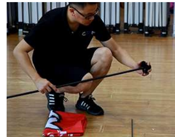
5 Insert the plastic cap onto the pole